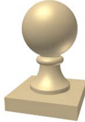
Ball Finial 1 Pier Cap All in one piece, no choice Base: 380mm sq x 560mm high Ball Diameter - 300mm