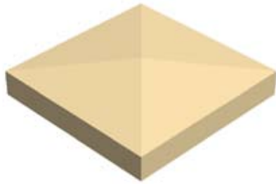
Standard Pier Cap