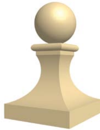
Ball Finial 2 Pier Cap Base: 380mm sq x 350mm high Ball Diameter - 225 or 300mm