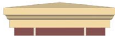
Moulded Pier Cap